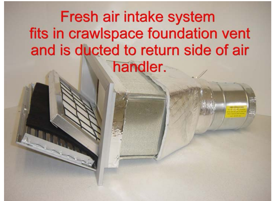
Fresh air intake system fits in crawlspace foundation vent and is ducted to return side of air handler.