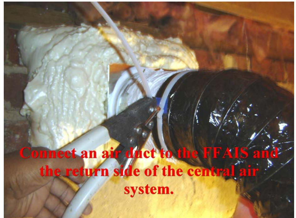
Connect an air duct to the FFAIS and the return side of the central air system.