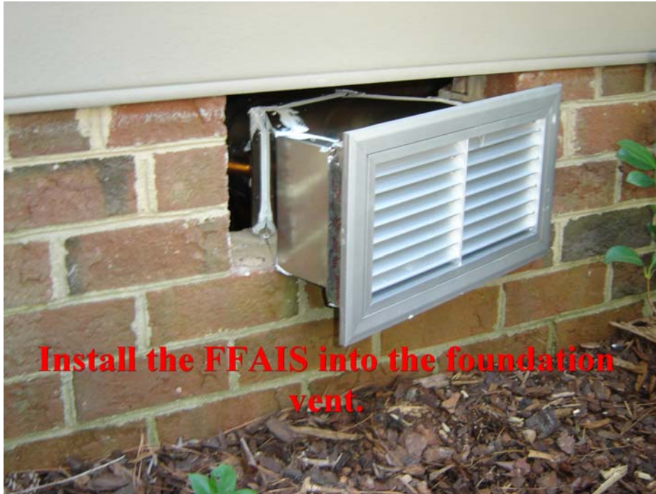
Install the FFAIS into the foundation vent.