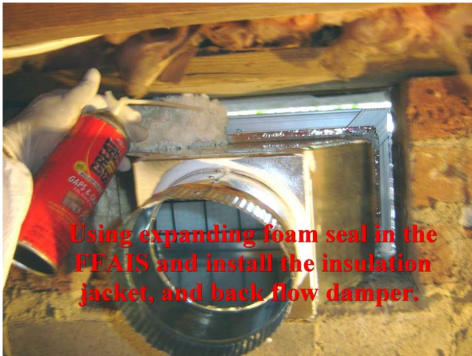
Using expanding foam seal in the FFAIS and install the insulation jacket, and back flow damper.