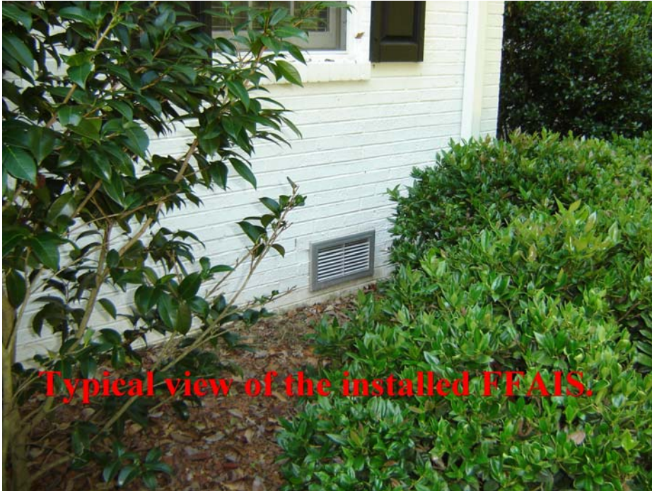
Typical view of the installed FFAIS.