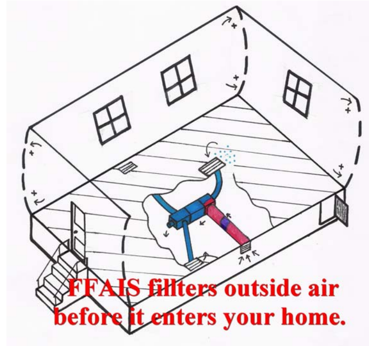
FFAIS filters outside air before it enters your home.