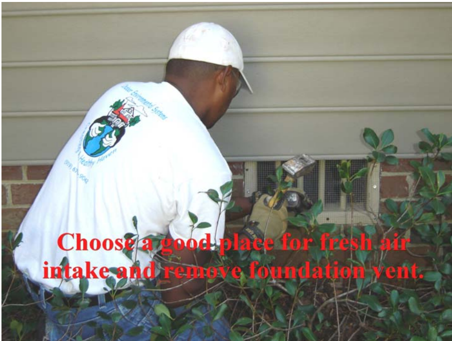
Choose a good place for fresh air intake and remove foundation vent.