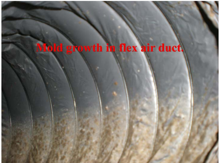
Mold growth in flex air duct.