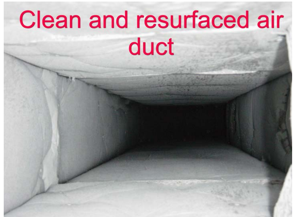
Clean and resurfaced air duct