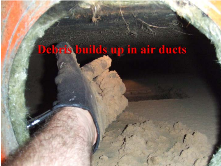
Debris builds up in air ducts