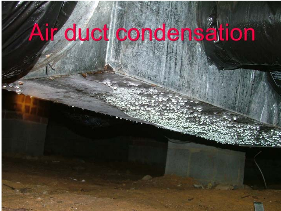
Air duct condensation