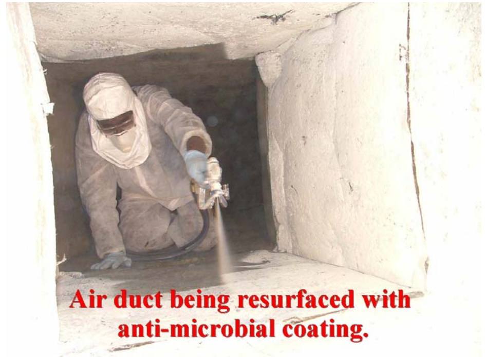
Air duct being resurfaced with anti-microbial coating.