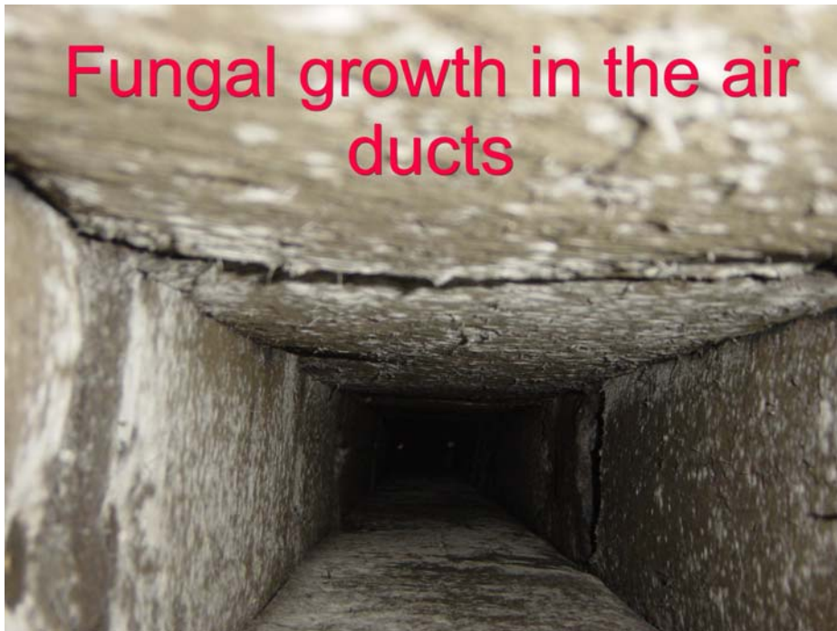
Fungal growth in the air ducts