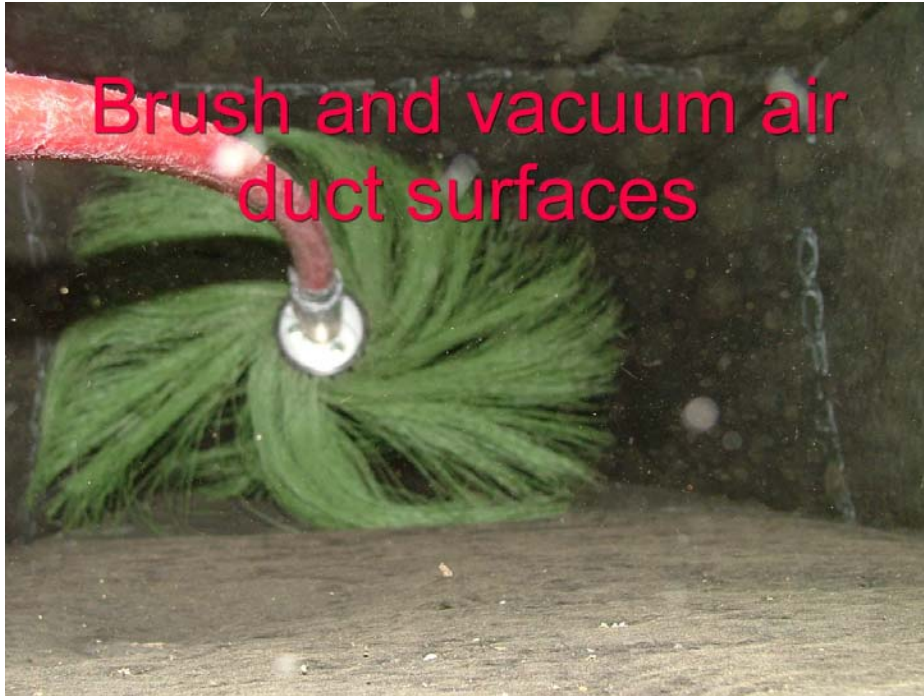
Brush and vacuum air duct surfaces