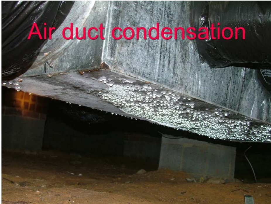
Air duct condensation