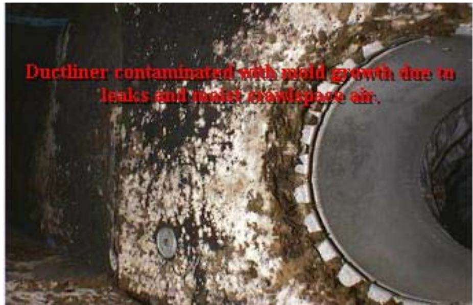
Ductliner contaminated with mold growth due to leaks and moist crawlspace air.