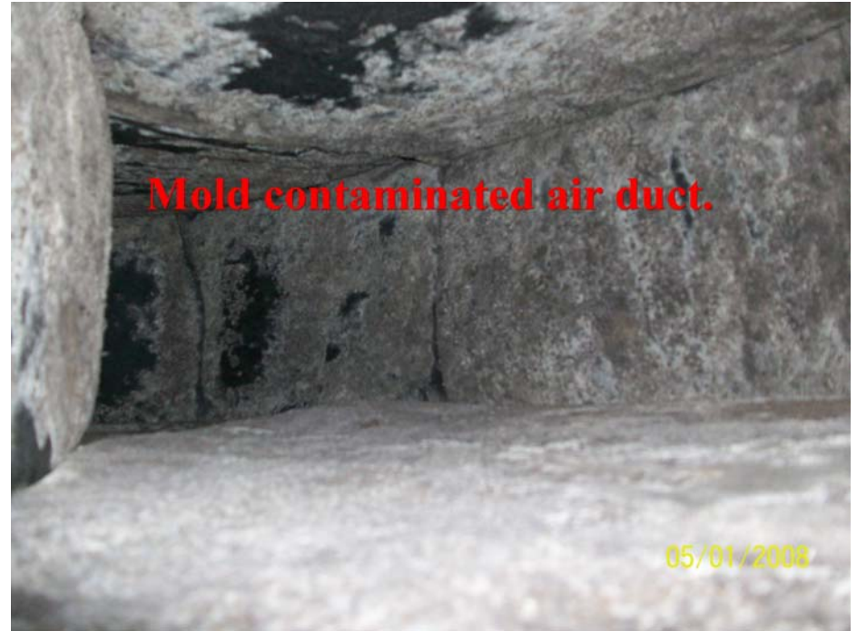
Mold contaminated air duct.