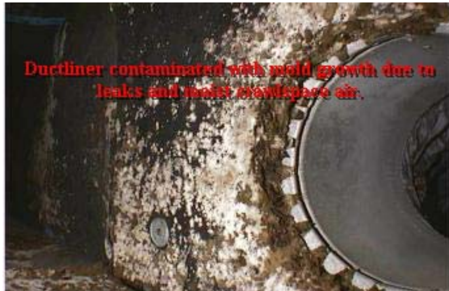
Ductliner contaminated with mold growth due to leaks and moist crawlspace air.