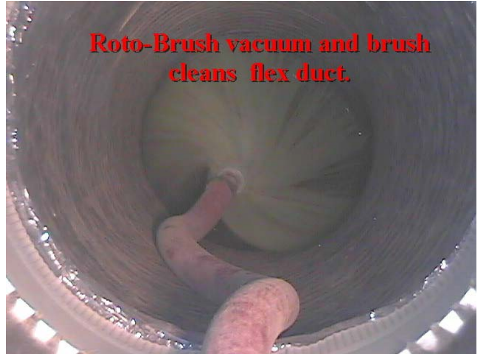
Roto-Brush vacuum and brush cleans flex duct.