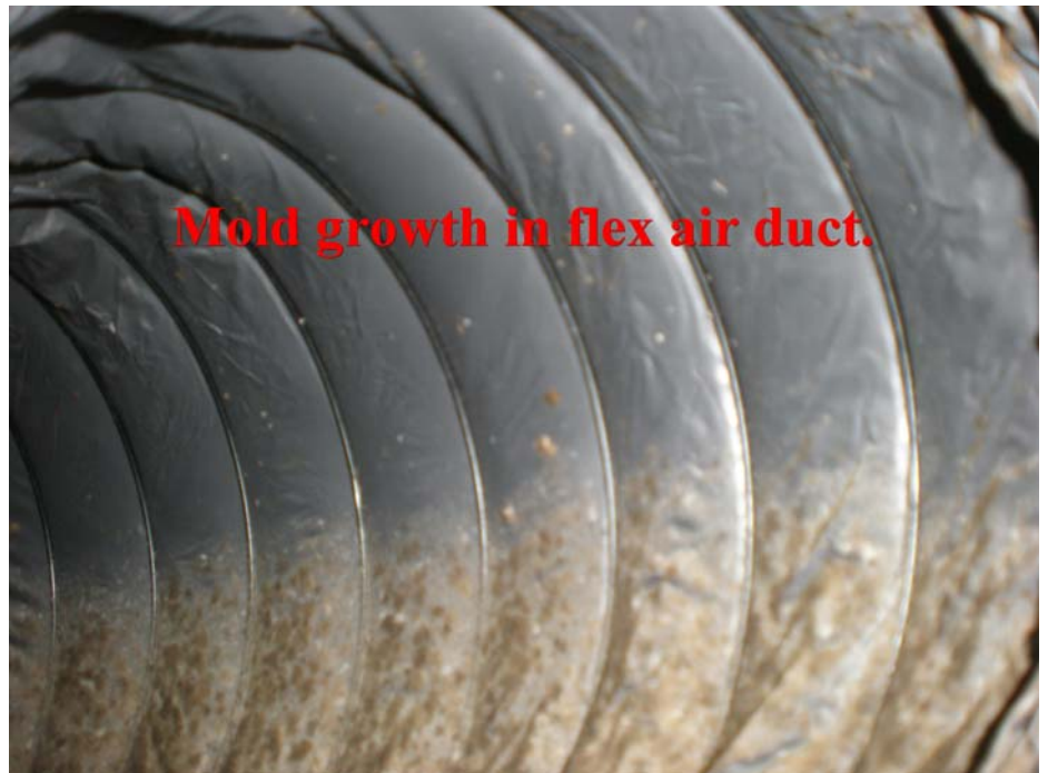
Mold growth in flex air duct.